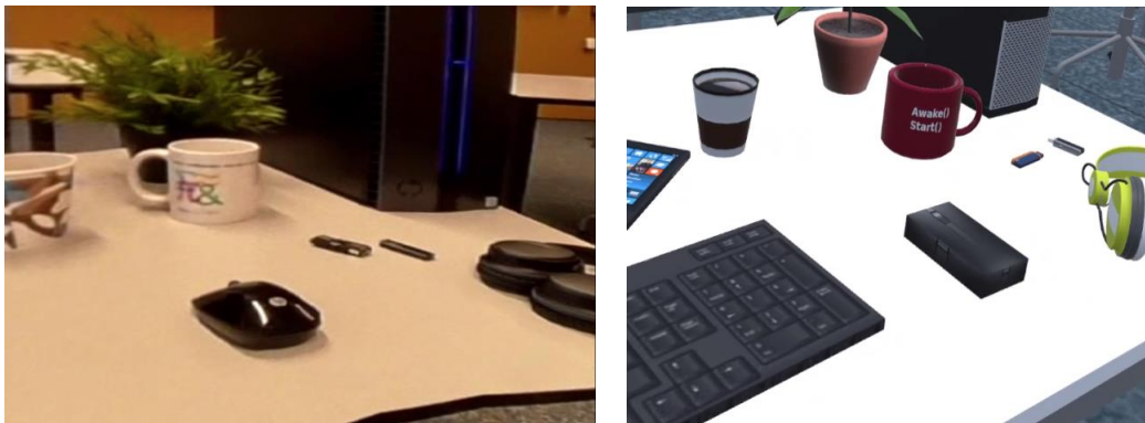
Figure 2 : Comparison of a computer mouse in VR 360 video and VR 3D

The VR 3D images generated for this study are close to reality, except for the computer mouse. This image is hardly identifiable, as it consists of a large dark grey rectangle, and may represent any other item. In spite of being placed very close to the keyboard, thus providing a good perceptive clue, the computer mouse in VR 3D was only identified after 00 :00 :02 sec, while it was identified after 00 :00 :01 in VR 360 video. It can be deduced that the simplicity of an item in VR 3D must go hand in hand with a similitude with the real item, in order to guarantee a short perception time.